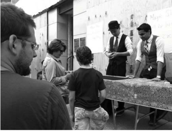
Magicians at the Mayfly Festival.

The Millheim Business Community's Mayfly Festival in early June was a complete success in the eyes of the merchants and the many visitors we attracted to downtown Millheim. Musicians, craftsfolk, food vendors and magicians all helped bring some sparkle to the Millheim "brand."