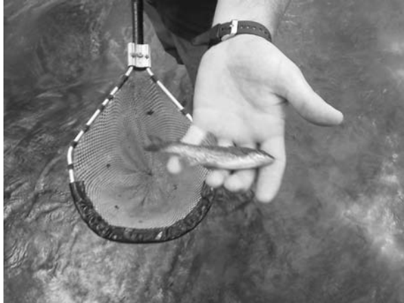
Eastern Brook Trout young of the year.