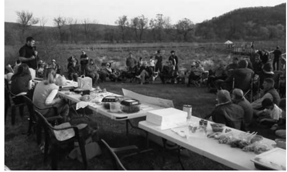
Attendees enjoy a presentation at the Soiree in the Swamp.